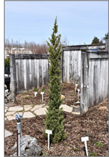
Trautman Juniper

This shrub should only be grown in full sunlight. It is very adaptable to both dry and moist growing conditions, but will not tolerate any standing water. It is not particular as to soil type or pH. It is highly tolerant of urban pollution and will even thrive in inner city environments. This is a selected variety of a species not originally from North America.