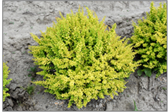
Sunsation Japanese Barberry

Sunsation Japanese Barberry is recommended for the following landscape applications;