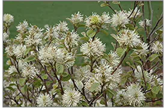
Dwarf Fothergilla flowers

This shrub does best in full sun to partial shade. It requires an evenly moist well-drained soil for optimal growth, but will die in standing water. It is not particular as to soil type, but has a definite preference for acidic soils, and is subject to chlorosis (yellowing) of the foliage in alkaline soils. It is somewhat tolerant of urban pollution. This species is native to parts of North America.