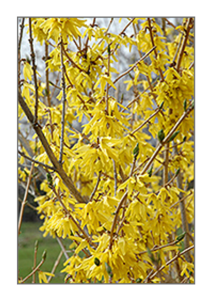
Northern Gold Forsythia flowers