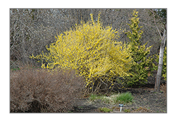
Northern Gold Forsythia in bloom

684 South Pelham Road Welland, ON L3C 3C8 905-735-5744 vermeers.ca