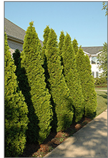
Emerald Green Arborvitae