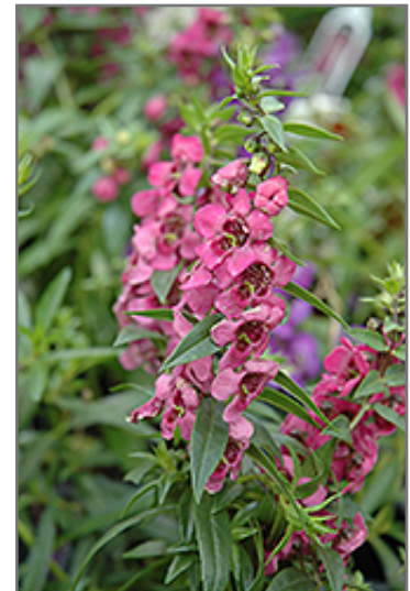
Pink Angelonia flowers