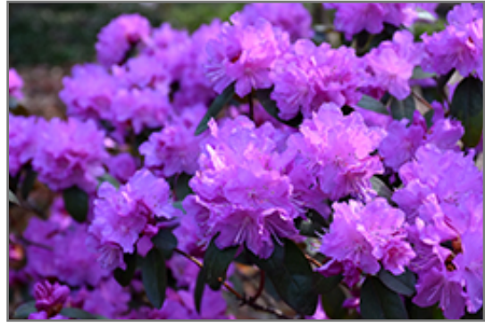
P.J.M. Elite Rhododendron flowers

P.J.M. Elite Rhododendron is recommended for the following landscape applications;