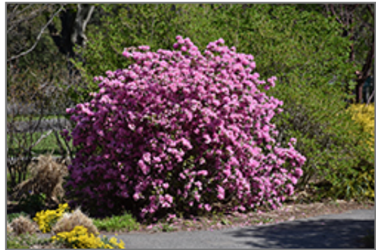
P.J.M. Elite Rhododendron in bloom