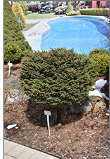
Little Gem Spruce (tree form)