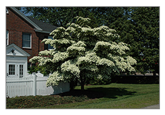
Chinese Dogwood in bloom

This is a relatively low maintenance tree, and should only be pruned after flowering to avoid removing any of the current season's flowers. It is a good choice for attracting birds to your yard. It has no significant negative characteristics.