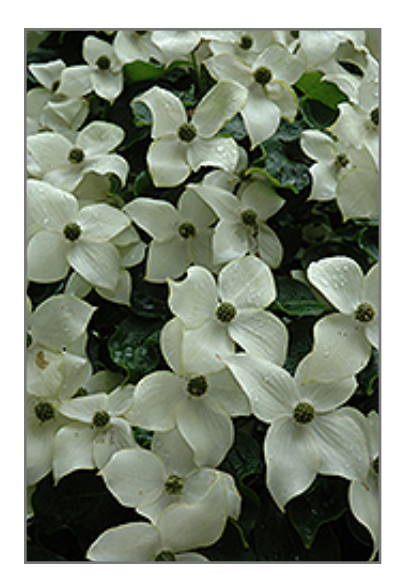
Chinese Dogwood flowers

684 South Pelham Road Welland, ON L3C 3C8 905-735-5744 vermeers ca